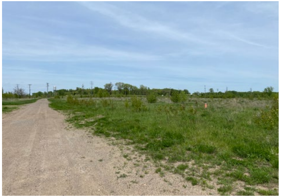
Looking North from the Southern Portion of the Rice Creek Commons Property

Furthermore, the developer will reimburse the City for previously incurred planning costs of $1 million. The developer has also agreed to construct three new City parks, previously estimated at $14.5 million. These